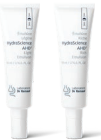
LIGHT EMULSION – RICH EMULSION

The skin is hydrated and looks smoother, healthier and more radiant. The skin is more resistant to exterior aggression.