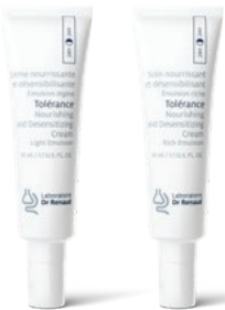
LIGHT EMULSION – RICH EMULSION

Instantly calms skin. Skin quickly becomes visibly stronger and more resistant. Reactivity is decreased, thanks to its nutritive elements.